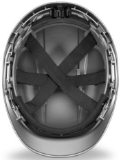
4 or 6 point Ratchet suspension