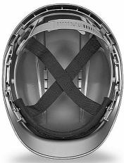
4 or 6 point Pin-lock suspension