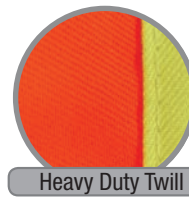
Heavy Duty Twill