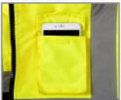
Flap chest pocket with gusset to fit any smartphone