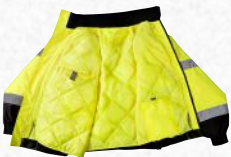
Easy on, easy off zip-out quilted lining