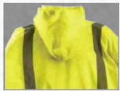
Convenient roll-away hood