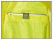
Inside chest pocket fits most tablets