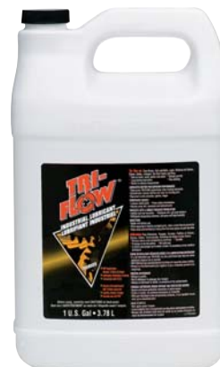
TF26020 1 gal. Non-Aerosol