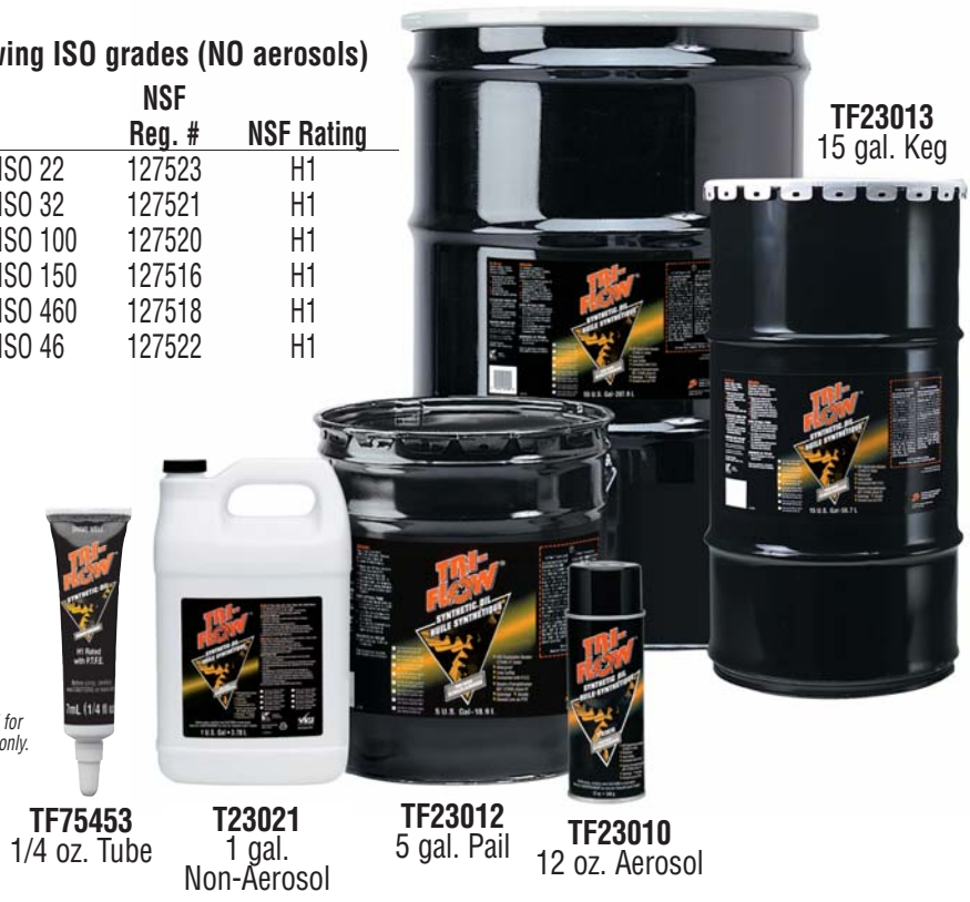
TF75453 1/4 oz. Tube