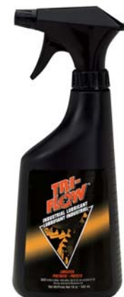
TF29200 18 oz. Trigger Spray