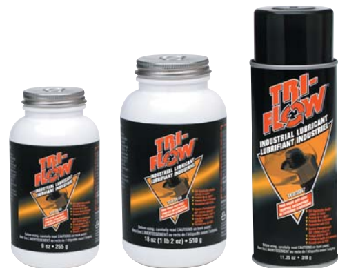
TF23015 9 oz. Jar