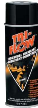
TF20027 12 oz. Aerosol