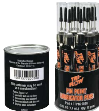
TFPN20028 Pin Point Pen Cylinder 12 pk.