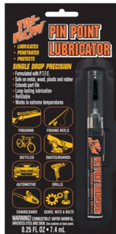
TFBC20027 Pin Point Pen Blister Card