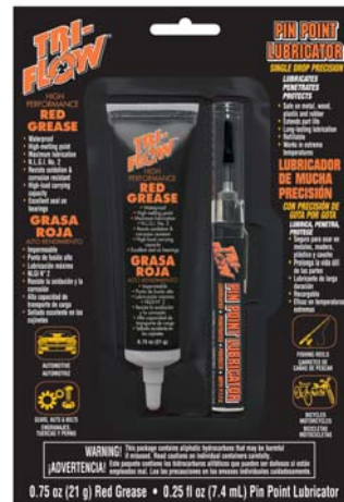
TFCC20029 .75 oz Red Grase / .25 fl. oz. Pin Point Lubricator Combo Card